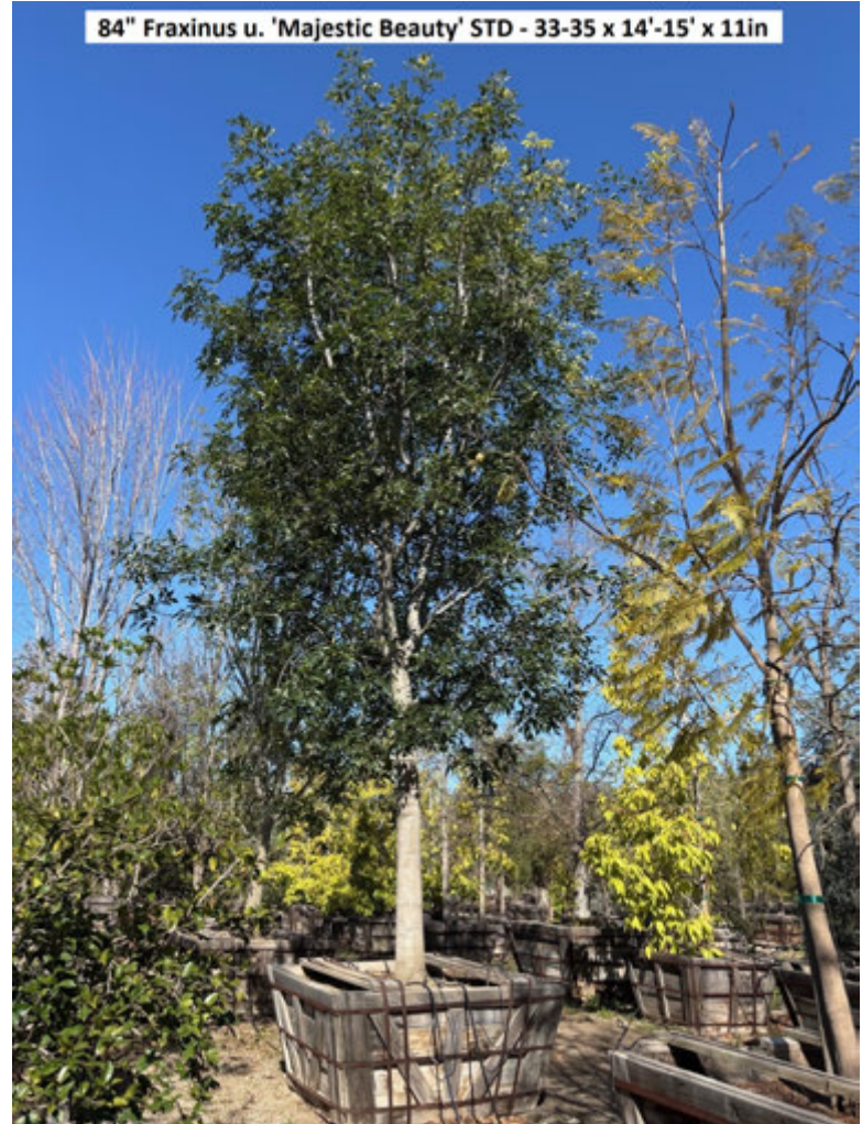
84" Fraxinus u. 'Majestic Beauty'

(Seedless, Fast-Growing, Semi-Evergreen)