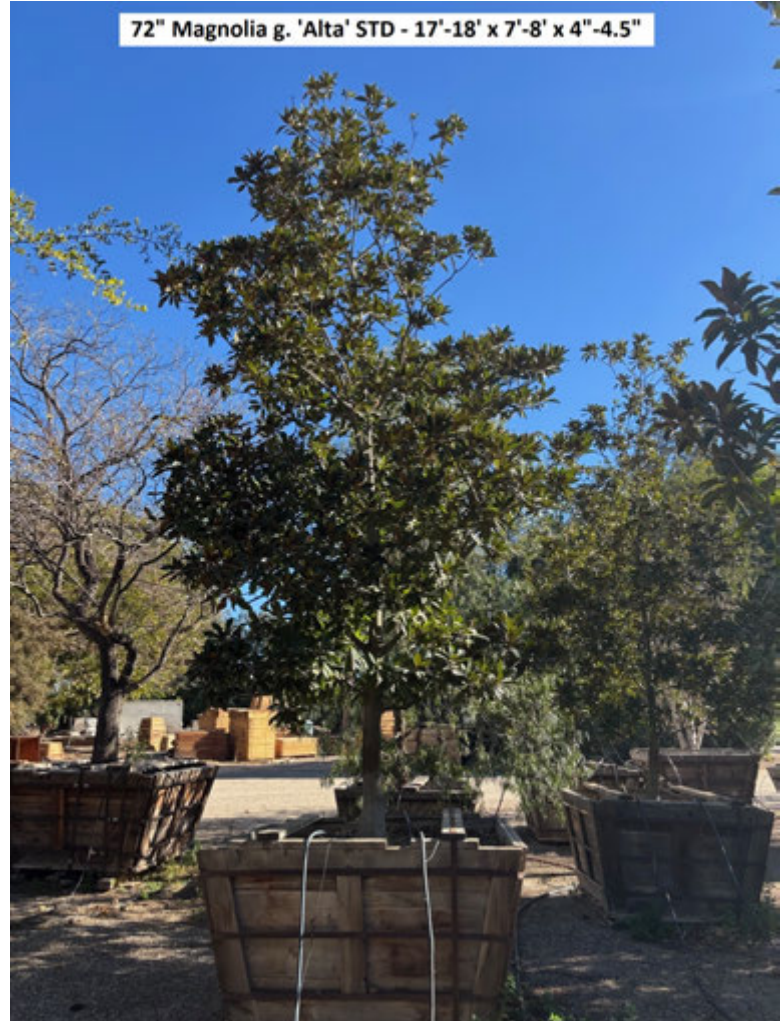
72" Magnolia g. 'Alta'

(Evergreen, White Fragrant Flowers in Summer)