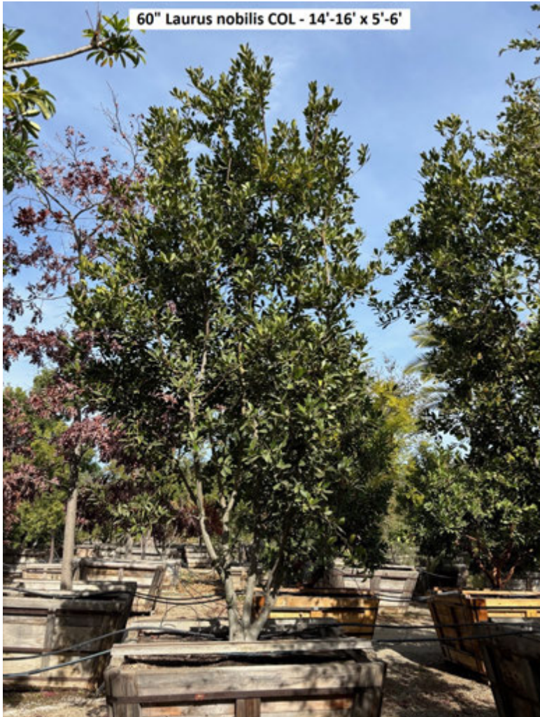
60" Laurus nobilis (Bay Laurel)

(Fast growing, evergreen, drought tolerant)