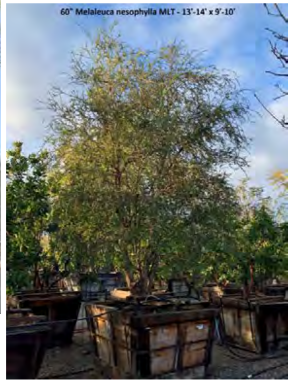
60" Melaleuca nesophylla MLT - 13'-14' x 9'-10'