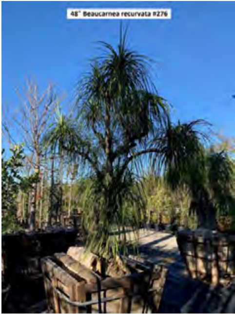
48" Beaucarnea recurvata #276