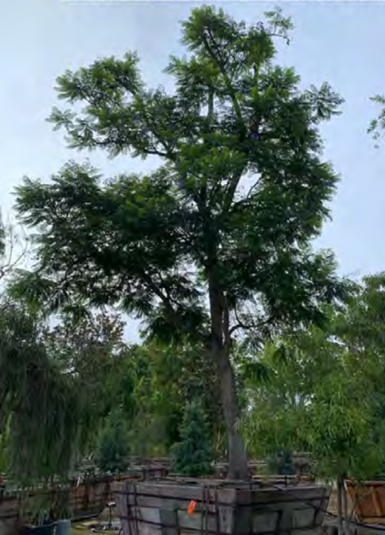
108" Jacaranda mimosifolia STD - 25'-27' x 14'-15' x 12'