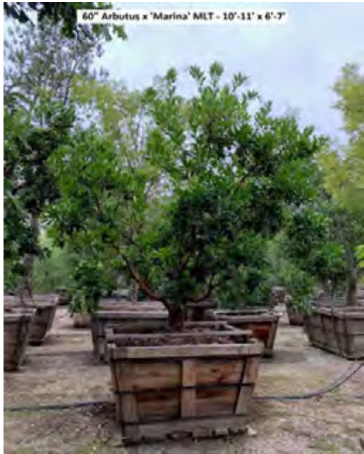
60" Arbutus x 'Marina' MLT - 10'-11' x 6'-7"