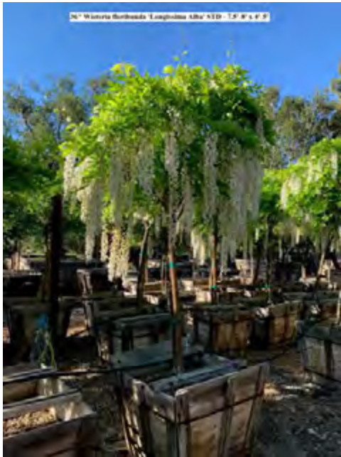
24" Wisteria floribunda 'Longissima Alba' STD - 7.5' 8" x 6.7"