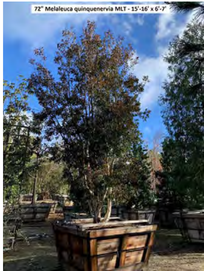
72" Melaleuca quinquenervia MLT - 15'-16' x 6'-7'