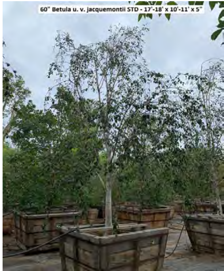
60" Betula u. v. Jacquemontii STD - 17'-18' x 10'-11' x 5"