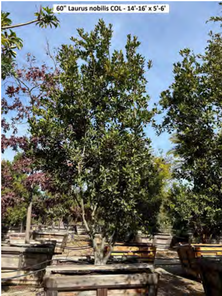
60" Laurus nobilis (Bay Laurel)

(Fast growing, evergreen, drought tolerant)