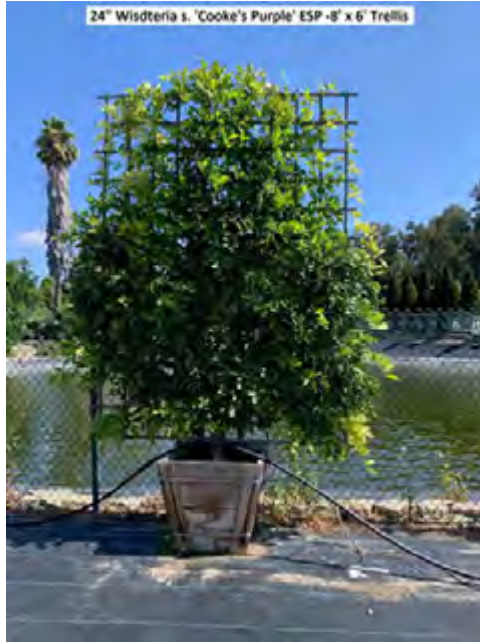
24" Wisteria s. 'Cooke's Purple' ESP - 8' x 6' Trellis