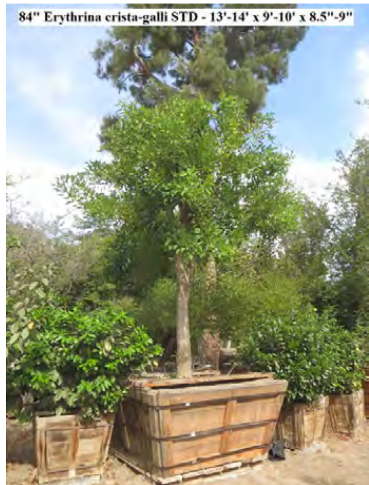
84" Erythrina crista-galli STD - 13'-14' x 9'-10' x 8.5"-9"