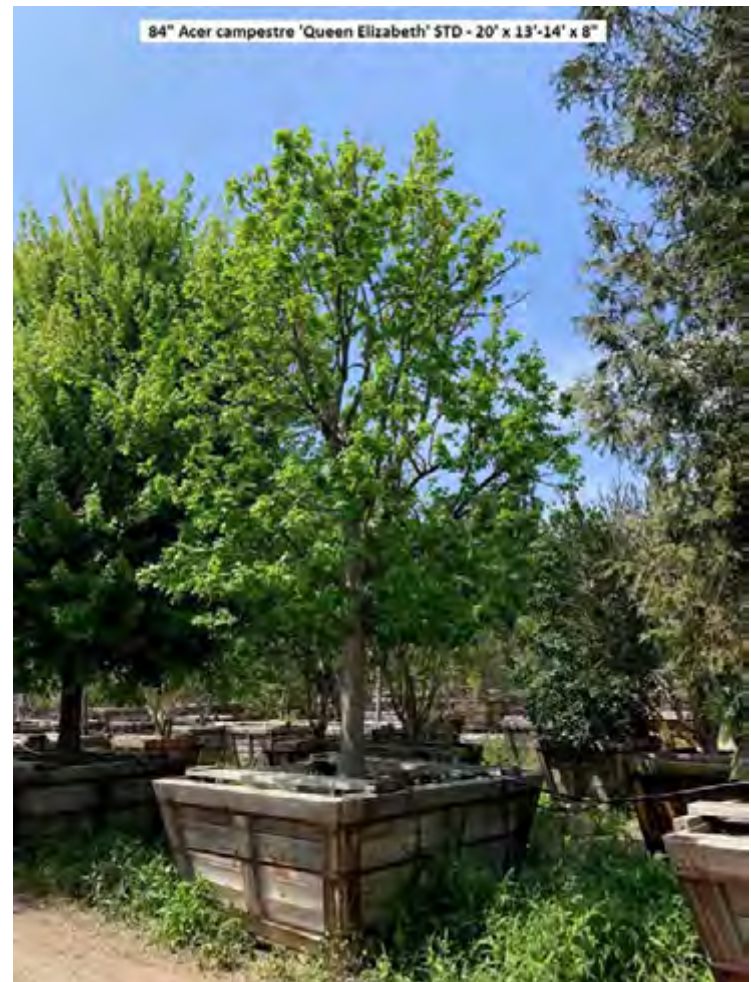
84" Acer campestre 'Queen Elizabeth' STD - 20' x 13'-14' x 8"