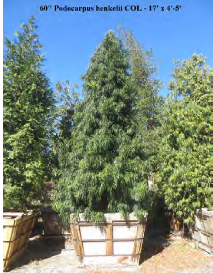
60" Podocarpus henkelii COL - 17' x 4'-5'