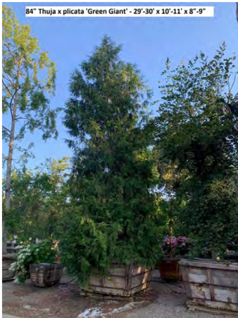
84" Thuja x plicata 'Green Giant' - 29'-30' x 10'-11' x 8"-9"