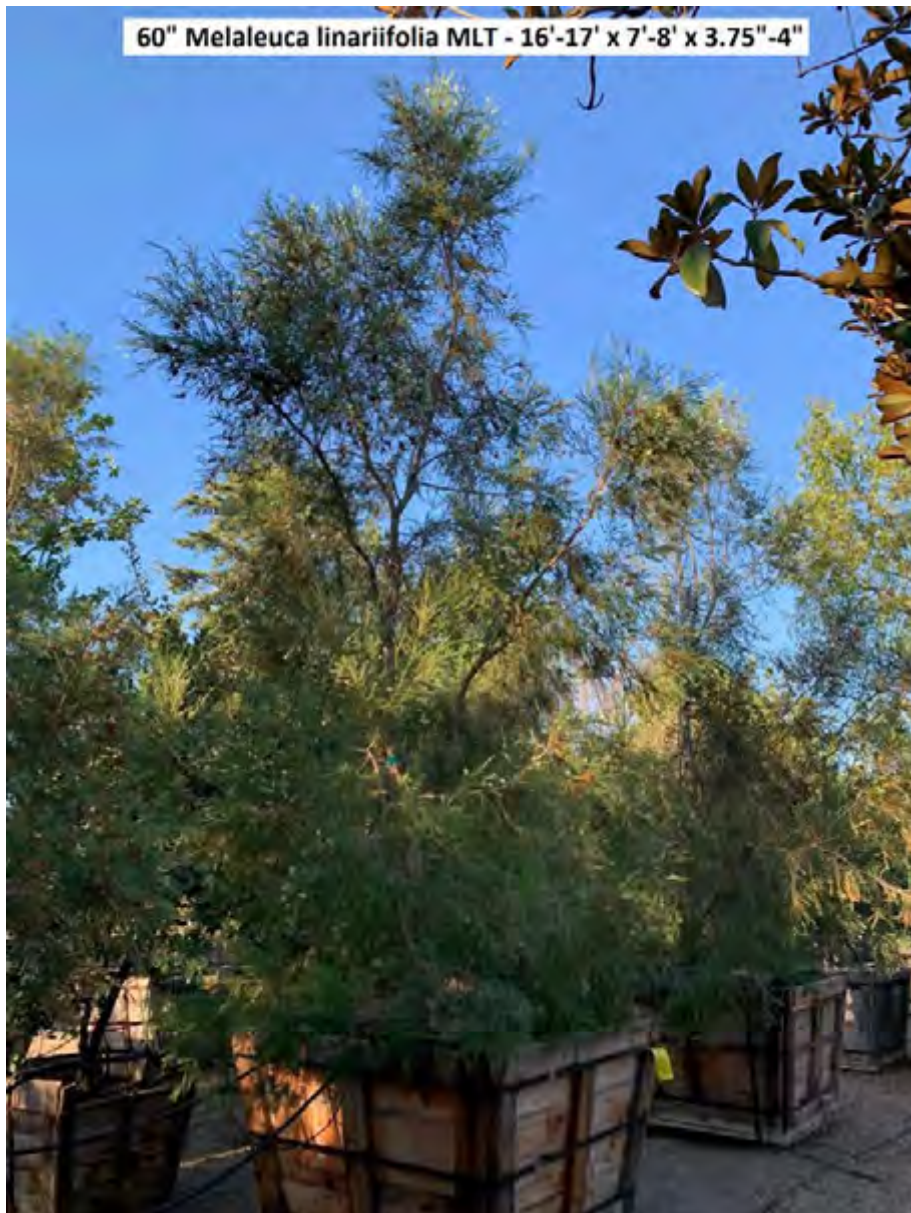
60" Melaleuca linariifolia MLT - 16'-17' x 7'-8' x 3.75"-4"