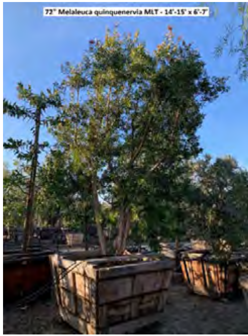
72" Melaleuca quinquenervia MLT - 14'-15' x 6'-7'