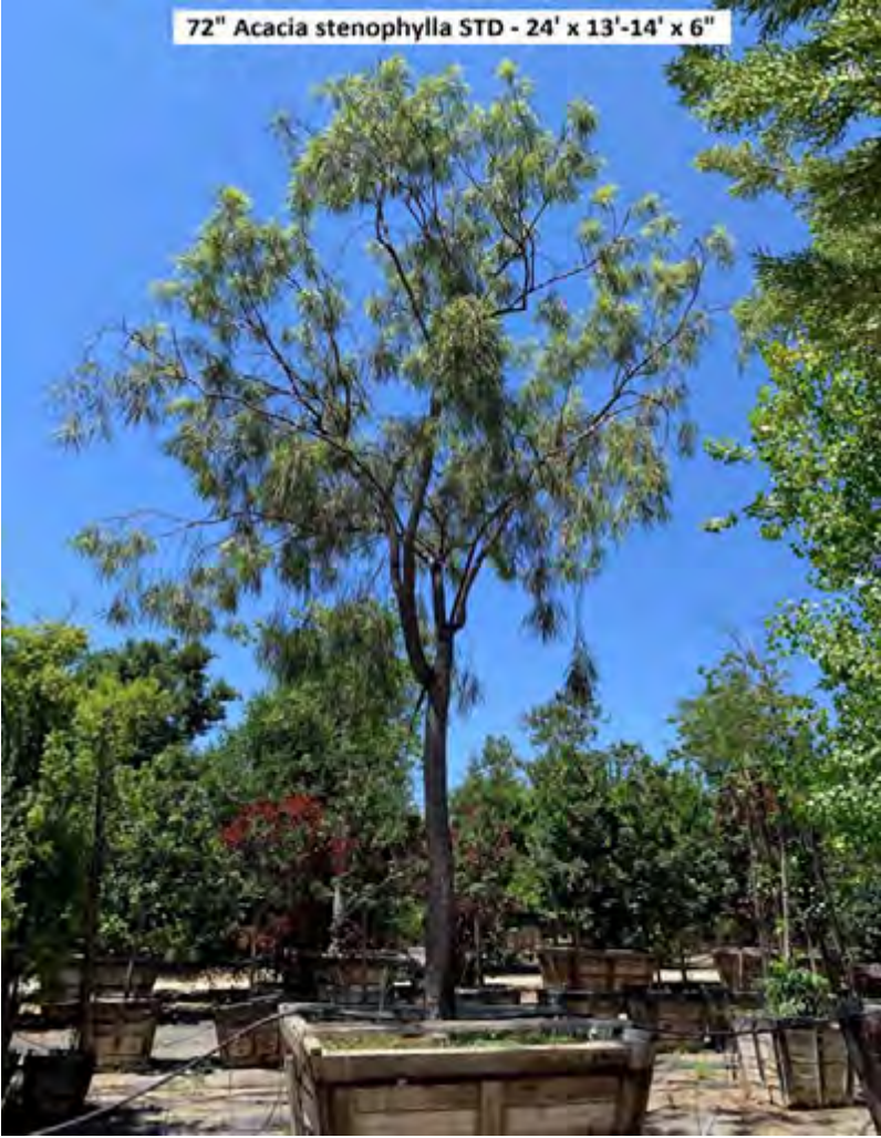
72" Acacia stenophylla STD - 24' x 13'-14' x 6"