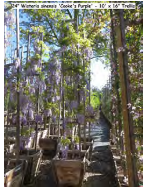
24" Wisteria sinensis 'Cooke's Purple' - 10' x 16" Trellis