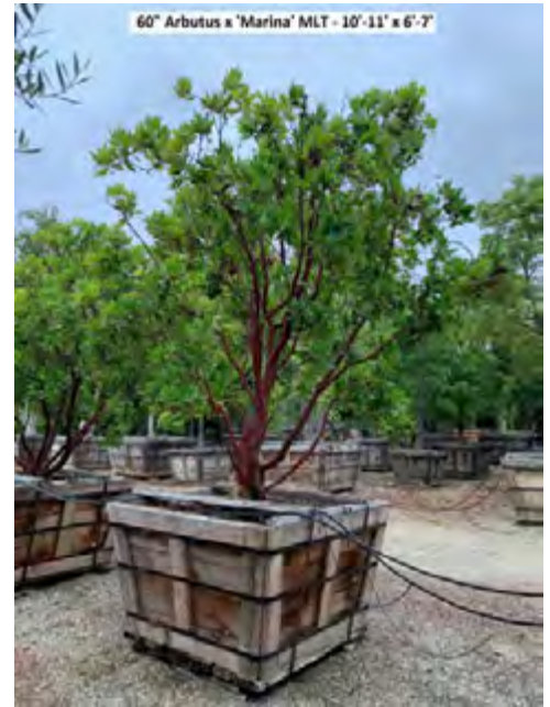
60" Arbutus x 'Marina' MLT - 10'-11' x 6'-7"