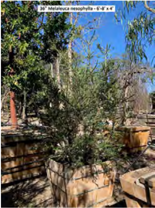
36" Melaleuca nesophylla - 6'-8' x 4'