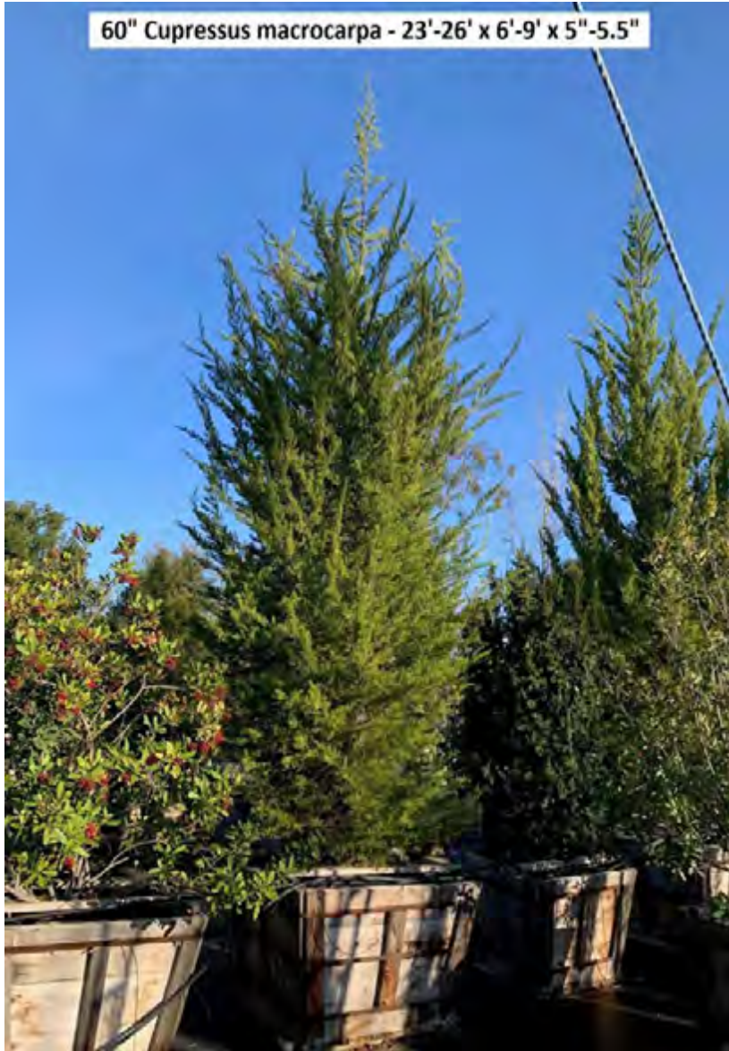
60" Cupressus macrocarpa - 23'-26' x 6'-9' x 5"-5.5"