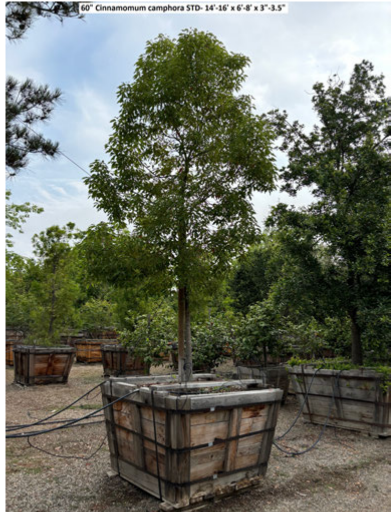
60" Cinnamomum camphora

(Fast growing, evergreen, drought tolerant)