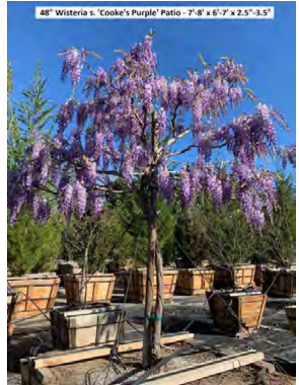
48" Wisteria s. 'Cooke's Purple' Patio - 7'-8" x 6'-7" x 2.5"-3.5"