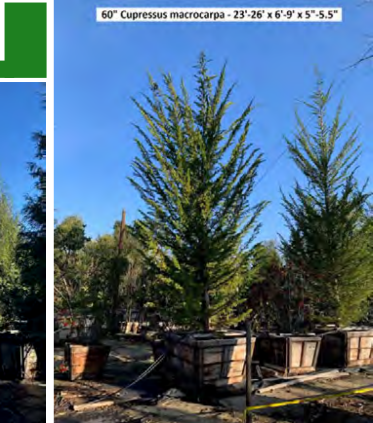
60" Cupressus macrocarpa - 23'-26' x 6'-9' x 5"-5.5"