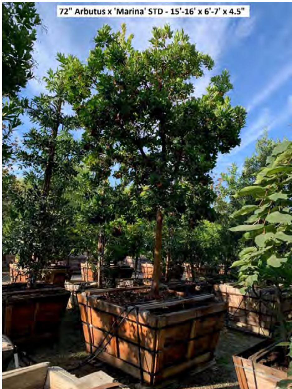
72" Arbutus x 'Marina' STD - 15'-16' x 6'-7' x 4.5"