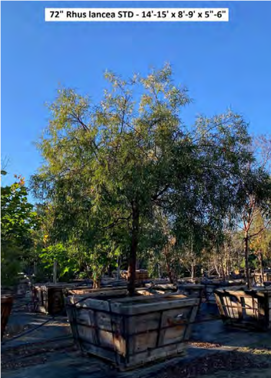
72" Rhus lancea STD - 14'-15' x 8'-9' x 5"-6"