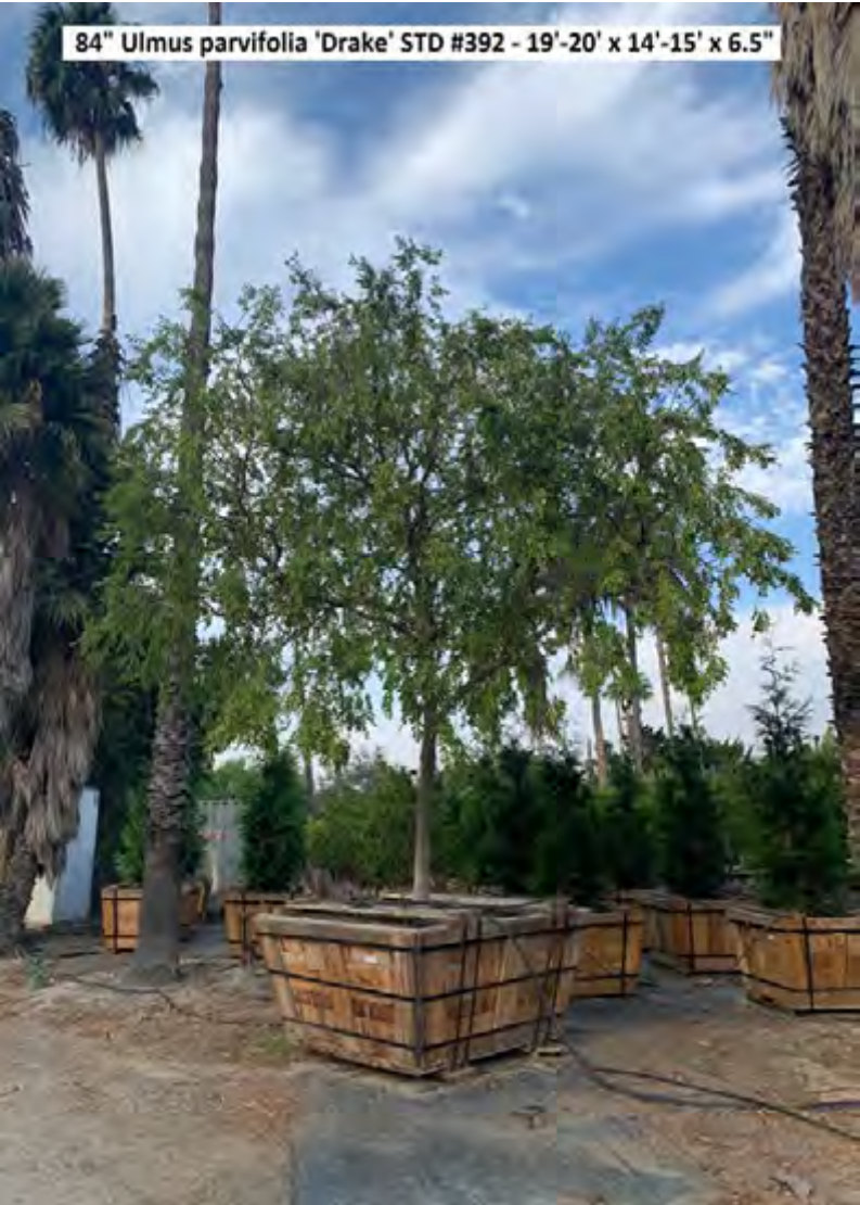
84" Ulmus parvifolia 'Drake' STD #392 - 19'-20' x 14'-15' x 6.5"