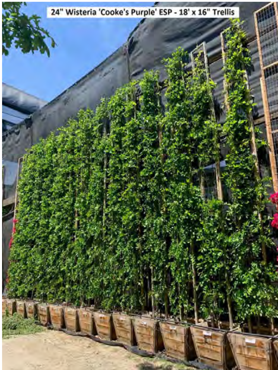
24" Wisteria 'Cooke's Purple' ESP - 18' x 16" Trellis