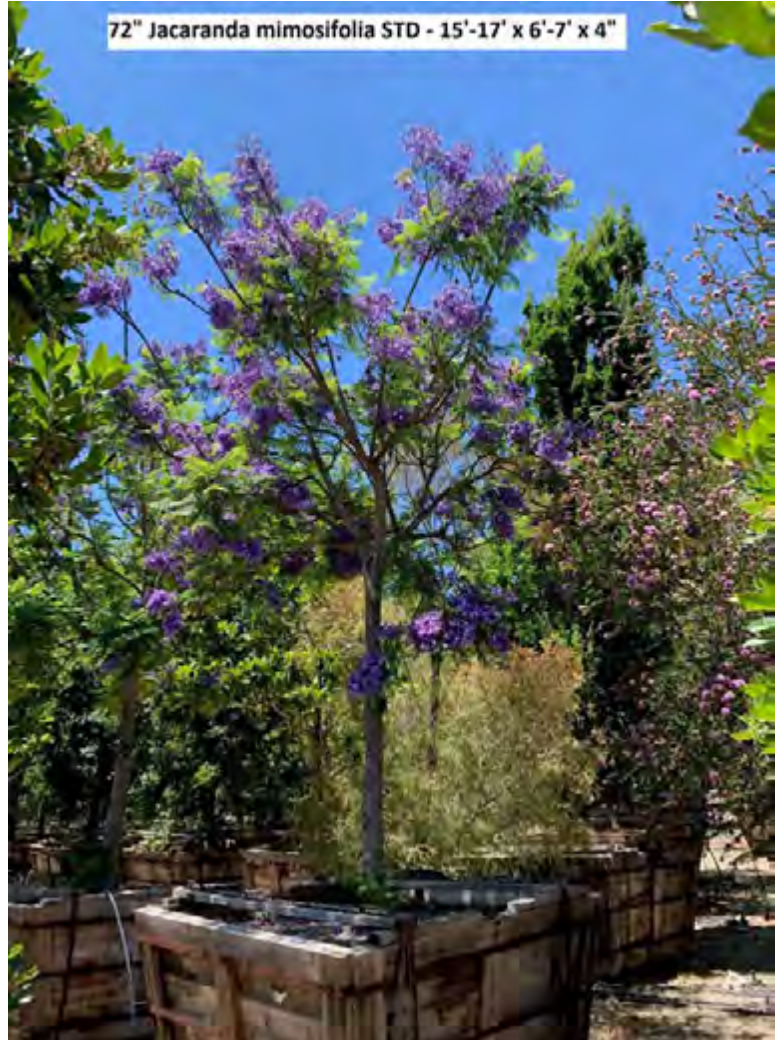
72" Jacaranda mimosifolia STD - 15'-17' x 6'-7' x 4"