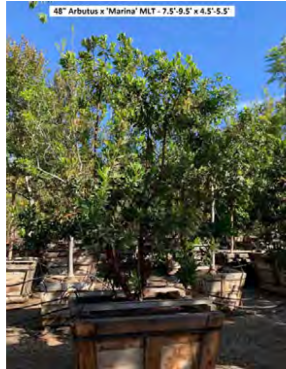
48" Arbutus x 'Marina' MLT - 7.5'-9.5' x 4.5'-5.5'