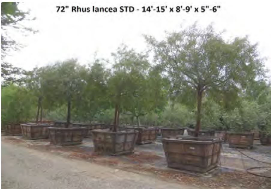
72" Rhus lancea STD - 14'-15' x 8'-9' x 5"-6"