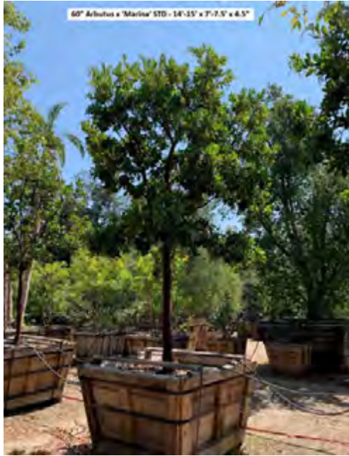
60" Arbutus x 'Marina' STD - 14'-15' x 7'-7.5' x 4.5"