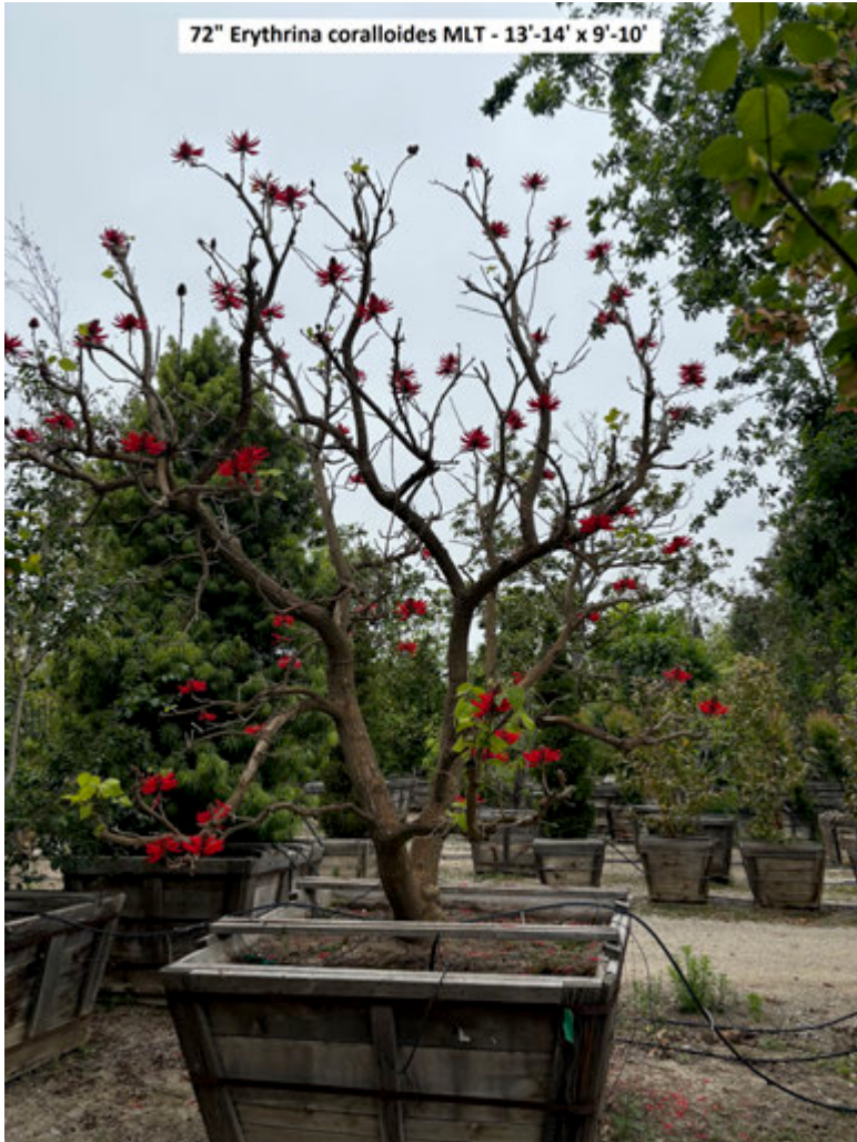
72" Erythrina coralloides - Naked Coral Tree - 8 available