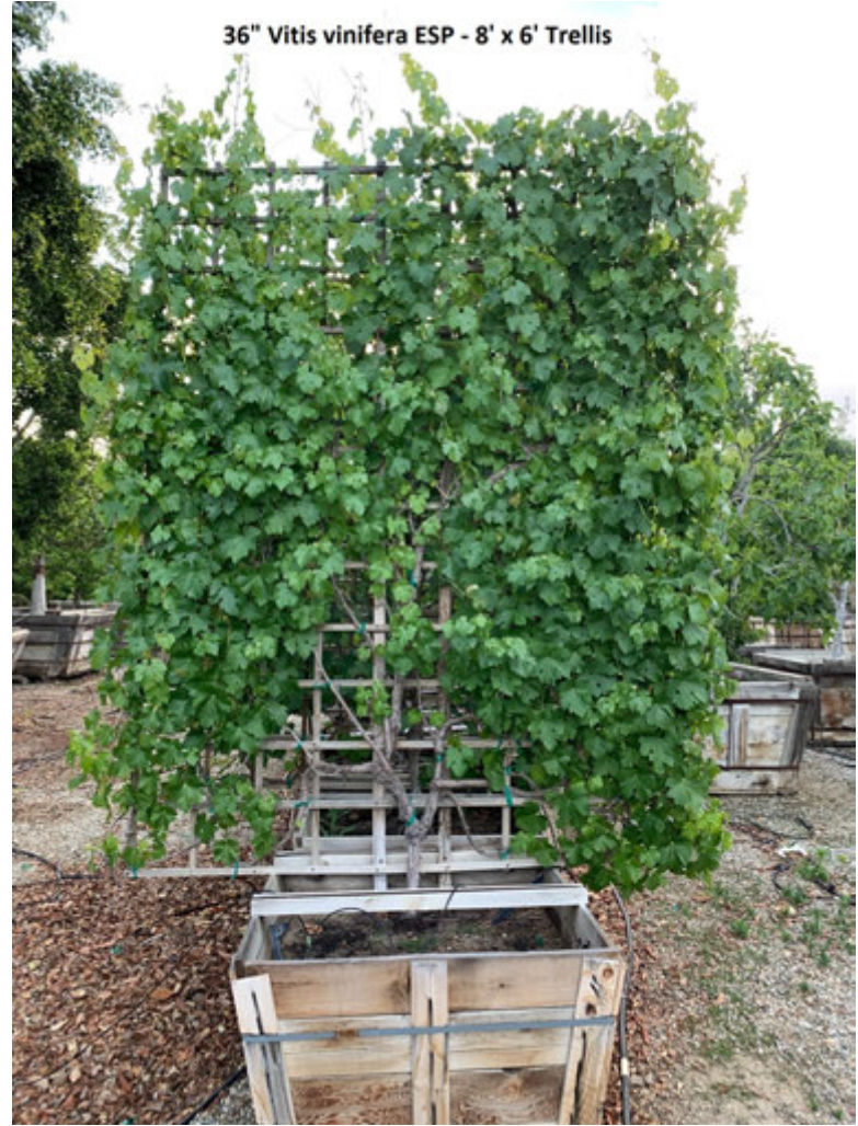
36" Vitis vinifera (Wine Grape) Espalier 8'Tx6'W