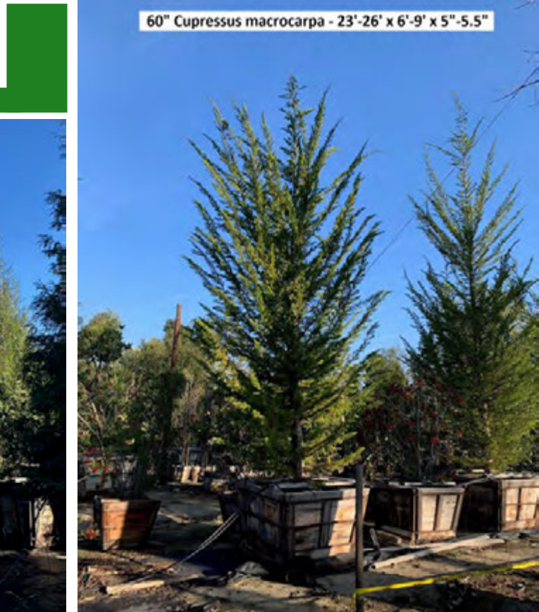
60" Cupressus macrocarpa - 23'-26' x 6'-9' x 5"-5.5"