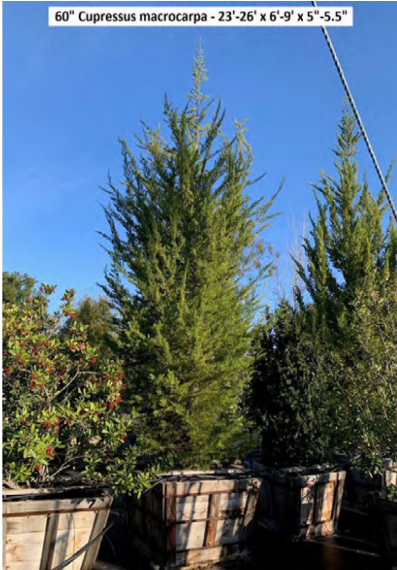
60" Cupressus macrocarpa - 23'-26' x 6'-9' x 5"-5.5"