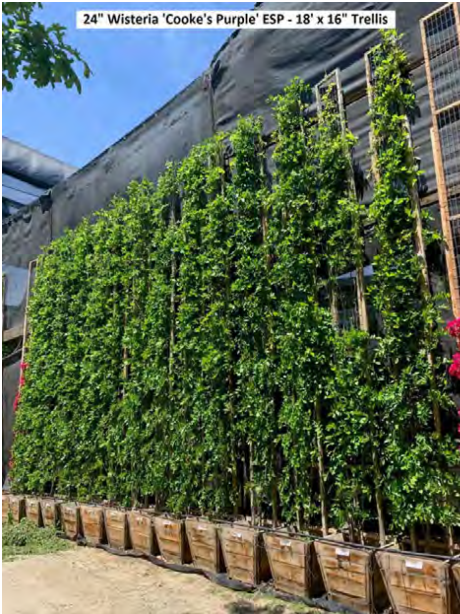
24" Wisteria 'Cooke's Purple' ESP - 18' x 16" Trellis