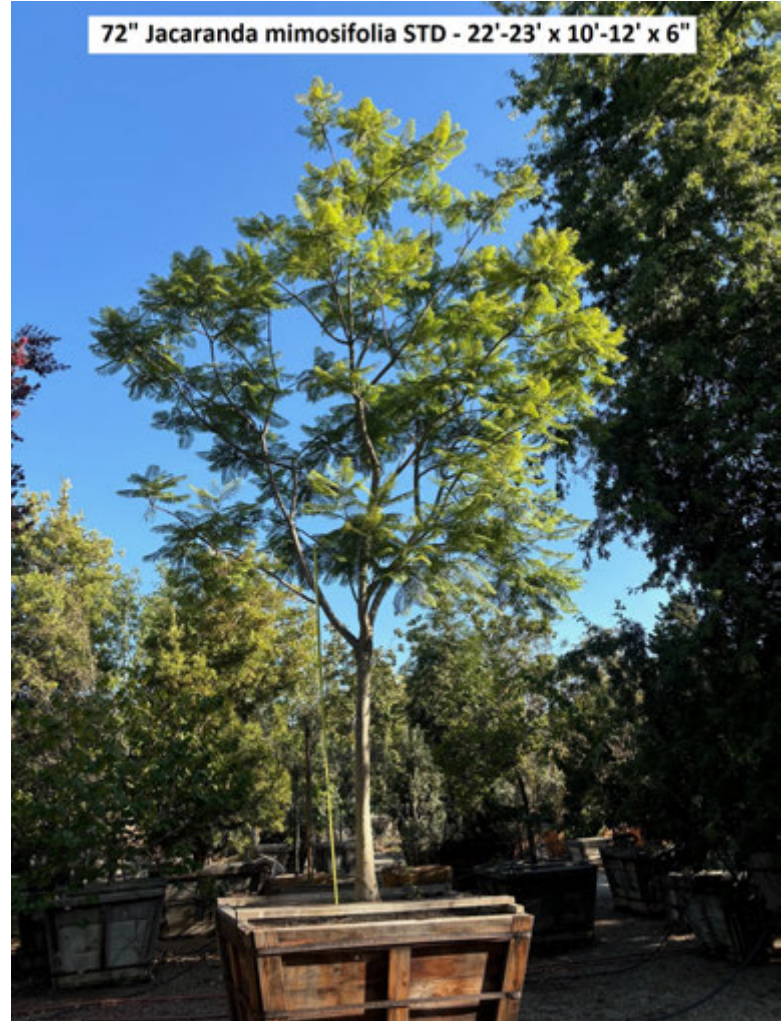
72" Jacaranda mimosifolia

(Semi-evergreen, Purple Flowers in Early Summer)