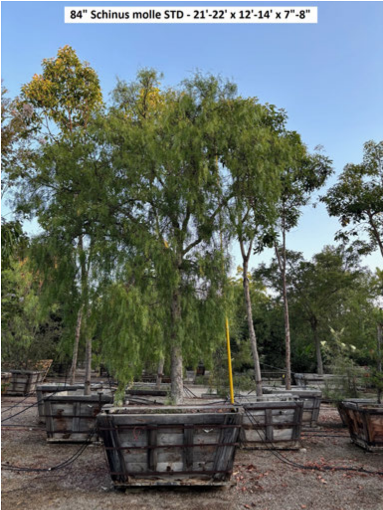
84" Schinus molle (California Pepper)

(Fast growing, evergreen, drought tolerant)