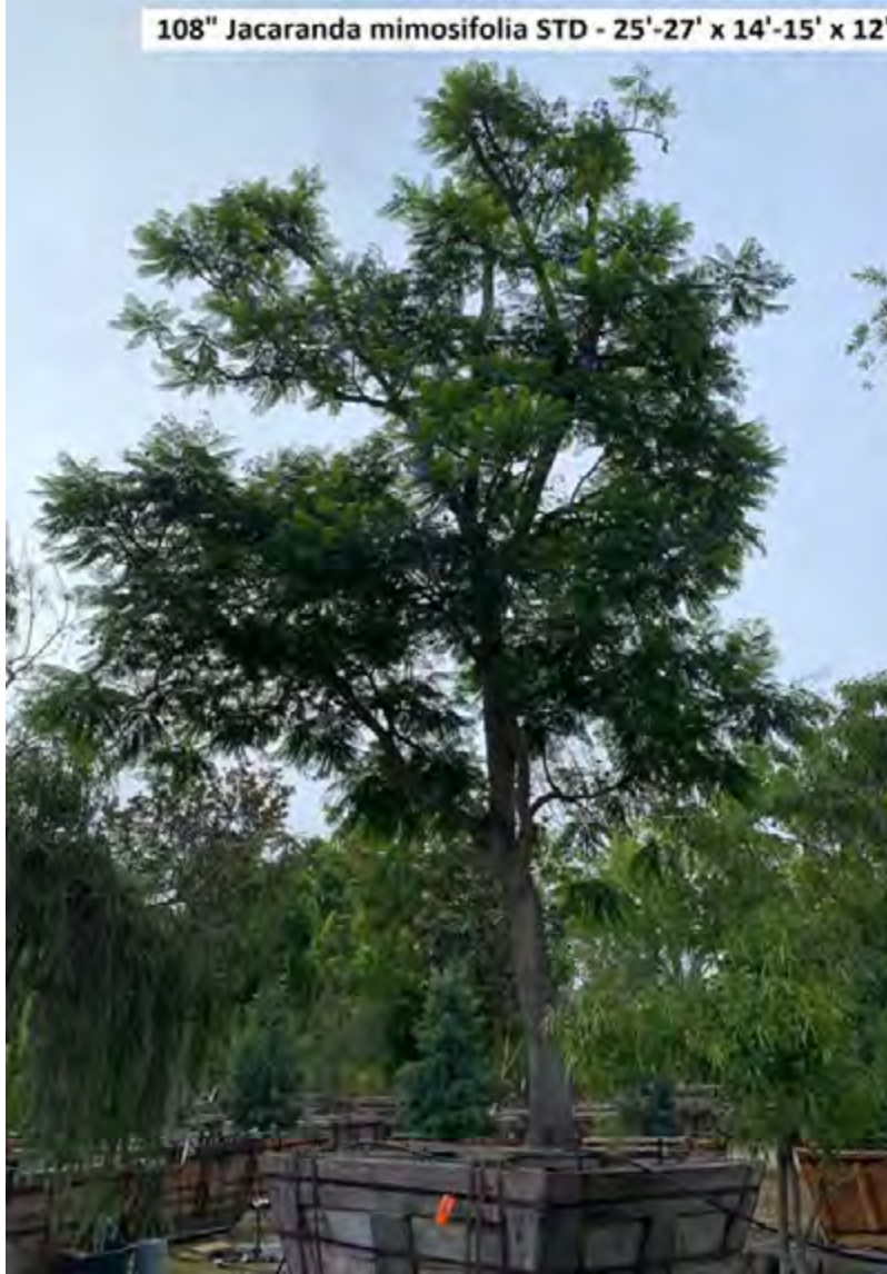
108" Jacaranda mimosifolia STD - 25'-27' x 14'-15' x 12'