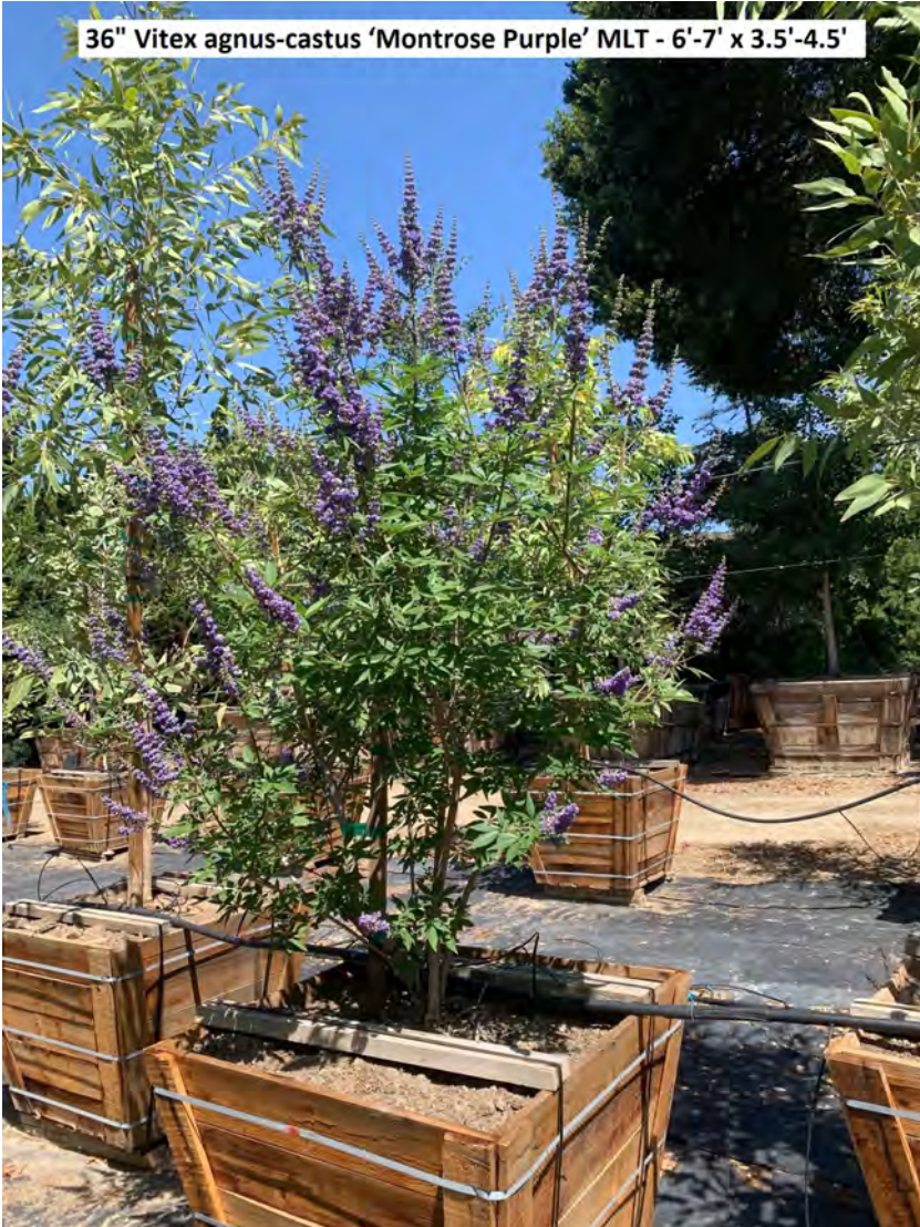
36" Vitex agnus-castus 'Montrose Purple' MLT - 6'-7' x 3.5'-4.5'