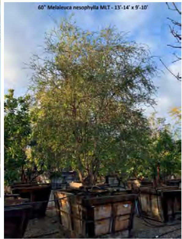
60" Melaleuca nesophylla MLT - 13'-14' x 9'-10'