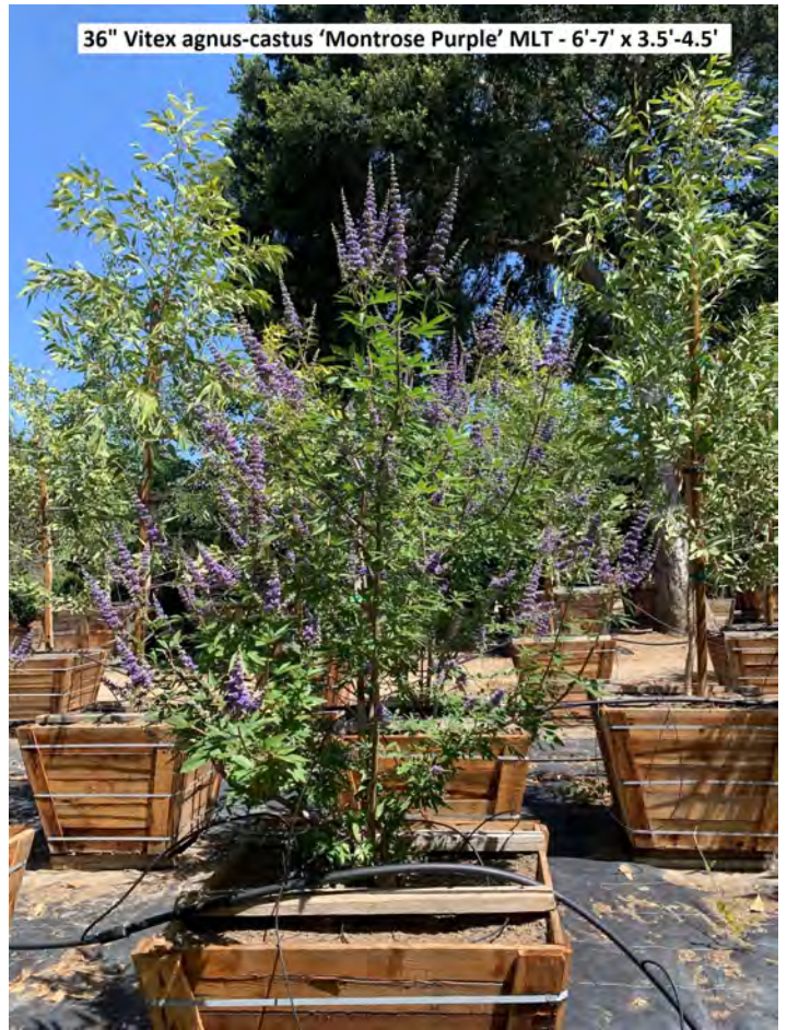
36" Vitex agnus-castus 'Montrose Purple' MLT - 6'-7' x 3.5'-4.5'