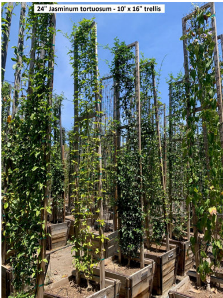
24" Jasminum tortuosum - 20+ available

(Fast growing, evergreen, fragrant flowers)