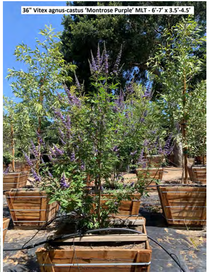
36" Vitex agnus-castus 'Montrose Purple' MLT - 6'-7' x 3.5'-4.5'