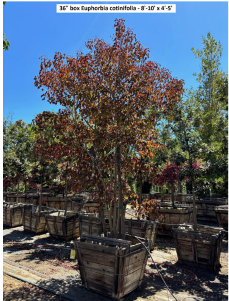
36" Euphorbia cotinifolia

(Fast growing, evergreen, fragrant flowers)